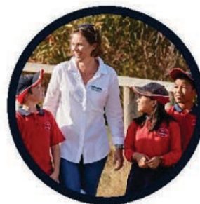
Build skills through fun