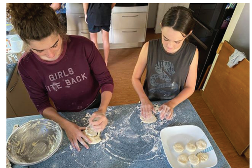
Students learning at home