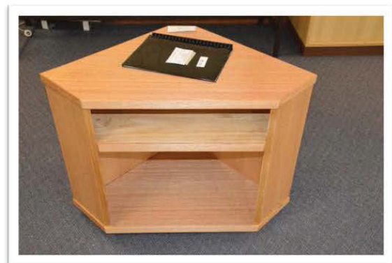
Some of our Year 12 major works