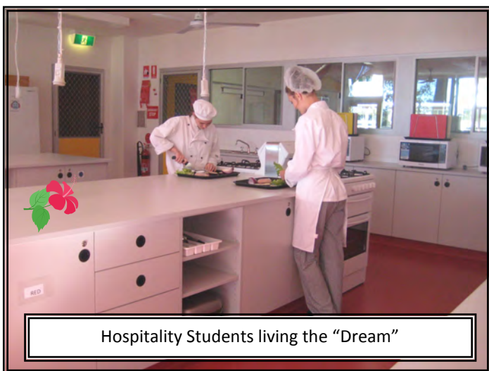
Hospitality Students living the "Dream"

At last the Home Economics TAS staff and their students have moved in to the wonderful new kitchens in Q block. What a pleasure it is to conduct a class in this 'state of the art' facility, with all of its high tech equipment and 'top of the line' machinery.