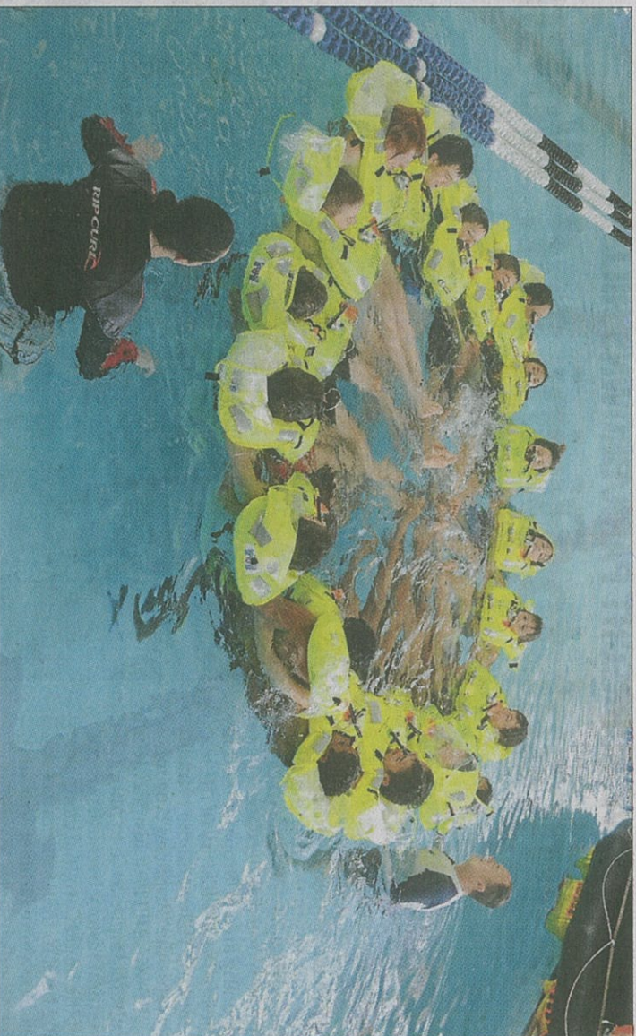
Increasing their chance of survival: Chatham High students and members from HMAS Albatross training at the aquatic leisure centre.

"It takes them out of their comfort zone," she said.